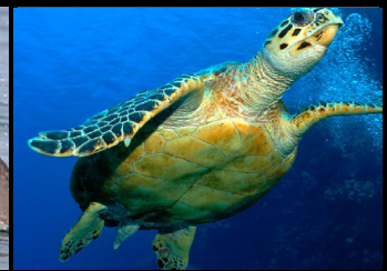
(Left) The polar bear is an animal that is facing very real threats through the loss of sea ice. (Centre) The Irrawaddy Dolphin that requires freshwater ecosystems to live in is also threatened. (Right) The hawksbill turtle is particularly sensitive to temperature changes.